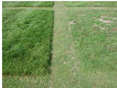
Fig. 4. Effects of fertilization [146.4 kg N per ha (left) and unfertilized (right)] on turfgrass quality and mowing height [7.6 cm (left) and 3.8 cm (right)] on crabgrass cover observed after the ambient temperature has reached freezing, 12 October 2006, East Lansing, MI.

Significant main effects of fertilizer on turfgrass quality were observed in 2006, while leaf species and mowing height produced no significant differences (Table 3, Fig. 4). A significant fertilizer × mowing height interaction was also observed in 2006.