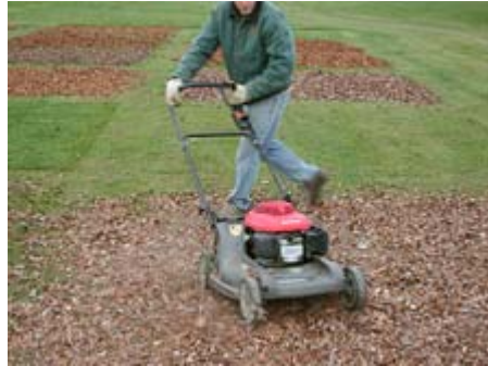
Fig. 3. Sugar maple leaves being mulching into an established Kentucky bluegrass stand, November 19, 2005, East Lansing, MI.

On 19 November 2004, prior to leaf mulch application, dandelion ( Taraxacum officinale W.) seed (V & J Seed, Woodstock, IL) was evenly spread over the experimental site to increase the seed bank level of broadleaf weeds. Dandelion seeds were applied at a rate of 2716.0 seeds/m 2 , equivalent to approximately 2.3 actively seeding dandelions per square meter (15). The Michigan Department of Agricultural Control Laboratory (East Lansing, MI) determined a germination rate of 5.0% using a 21-day germination test with a daily cycle of 16 h at 20.0°C and 8 h at 30.0°C, conforming to the Association of Official Seed Analysts rules for testing dandelion (Association of Official Seed Analysts, 2002). Later that day, tree leaves, with a particle size ranging from 2.5 to 6.4 cm 2 , were applied at rate of 1.5 kg/m 2 (dry weight), a leaf mulch application rate derived from Kowalewski et al. (11). The tree leaves were then incorporated into the turfgrass canopy using a rotary push mower set at a 5.1-cm mowing height (Fig. 3).