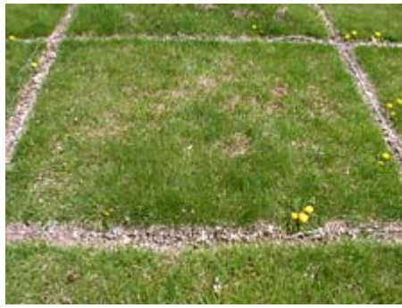
Fig. 1. Effects of sugar maple leaf mulch (applied at 1.5 kg/m 2 on 16 November 2004) on common dandelion populations in established Kentucky bluegrass observed by Kowalewski et al. (11), 8 May 2005, East Lansing, MI.