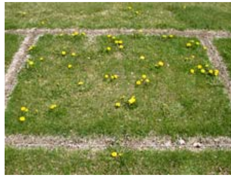
Fig. 2. Effects of no leaf mulch (control) on common dandelion populations in established Kentucky bluegrass observed by Kowalewski et al. (11), 8 May 2005, East Lansing, MI.

In response to these findings, a new experiment was initiated to develop a better understanding of how mulched tree leaves would affect dandelion populations in properly maintained cool-season turfgrass. The objective of this research was to quantify the efficacy of leaf mulch as an organic weed control method when combined with frequent nitrogen fertilizer applications and a mowing height conducive to a cool-season turfgrass mixture. The original hypothesis of this research was that leaf mulch applications, regardless of species, in combination with regular nitrogen fertilizer applications and an increased mowing height, would provide a well integrated turfgrass management system capable of providing long-term dandelion suppression.